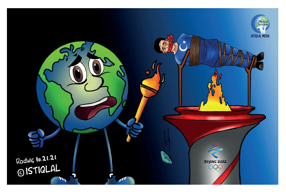
The Olympic flame was lit, but the world became darker.