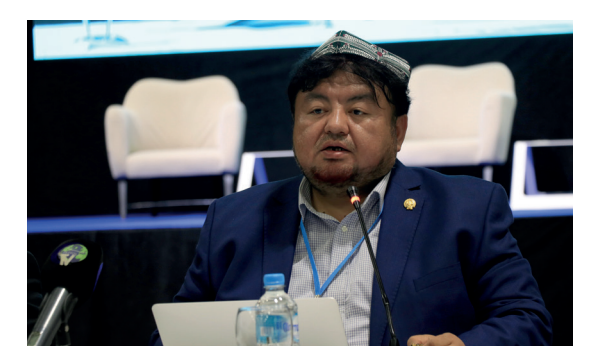
ating in Western countries.

3. Developing the organizational system of East Turkistan organizations, accelerating professionalization, and strengthening specialized staff.